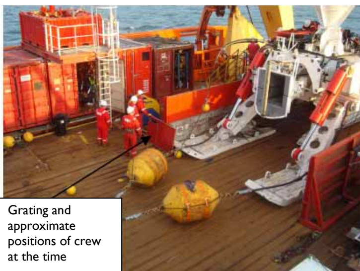
Grating and approximate positions of crew at the time

Whilst passing between the tigger and the plough guard the grating was disturbed and fell, striking the foot of the injured party. The grating was fitted with fixing lugs, one of which severely impacted the foot, penetrating the safety boot and caused the injuries.